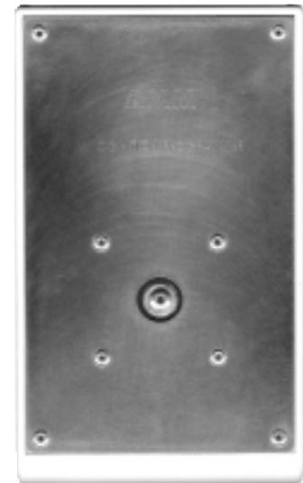
AMM - PROGRAMMER